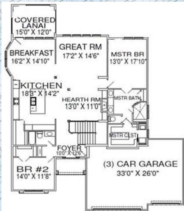
Main Level – approx. 2140 sq. ft.